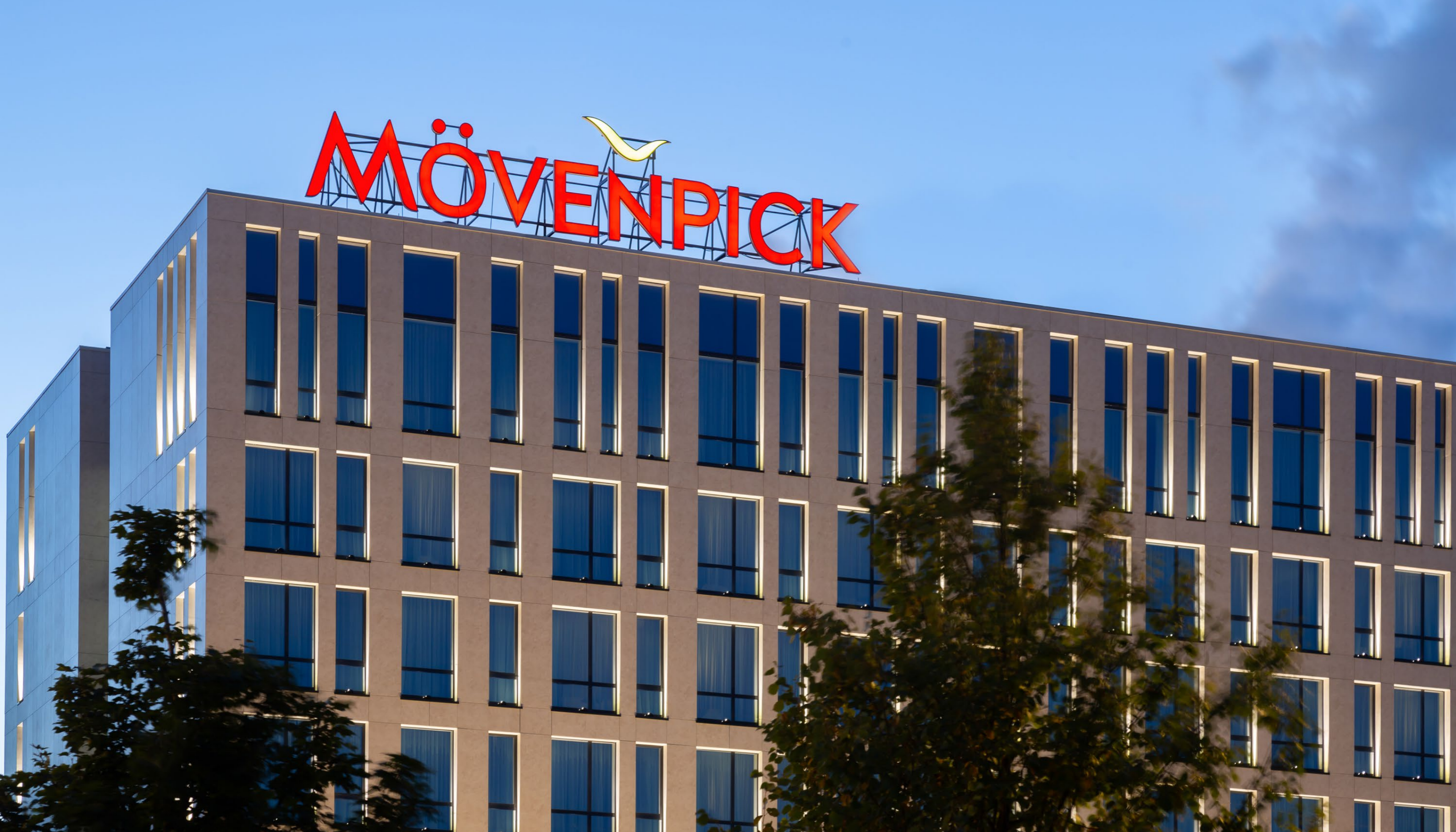
photo for hotels & resorts